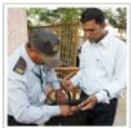
Surveillance and Investigation