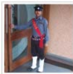
Trained Watch Guards