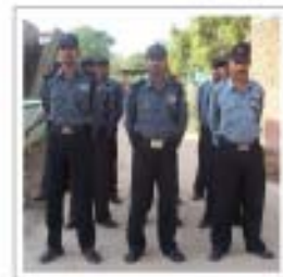
Event Security Management