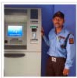
Electronic Security Solutions