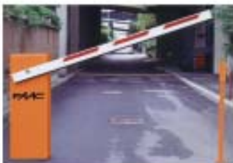
• Boom Barriers