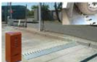
• Tyre Killers

FAAC India introduced hydraulics in the gate opening sector. And have perfected this technology adapting it to a multiplicity of needs. FAAC automated systems satisfy both Intensive use and Economic use. FAAC India began making its own electronic equipment which include control equipment, radio controls, as well as safety and signaling systems.