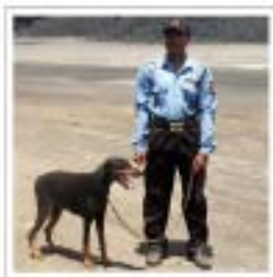
Armed Guards & Dog Squad

Totem International has entered into a strategic partnership for providing specialised skilled manpower for hotels, ports, airports and critical infrastructure. The personnel from CISS will be equipped with necessary gadgets and training for managing critical installations and disaster response.